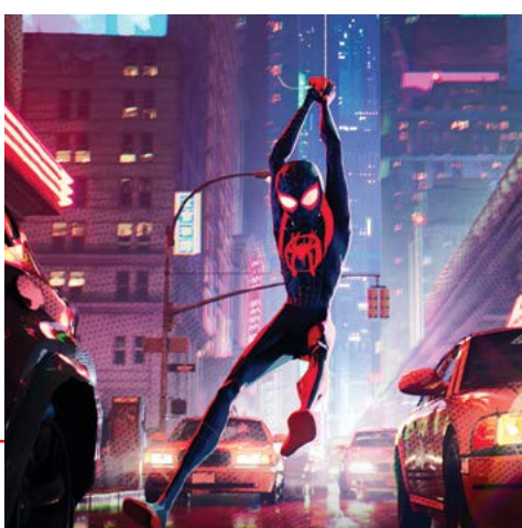
SPIDER-MAN: INTO THE SPIDER-VERSE © & TM 2020 MARVEL. ©2018 SPAI. ALL RIGHTS RESERVED.