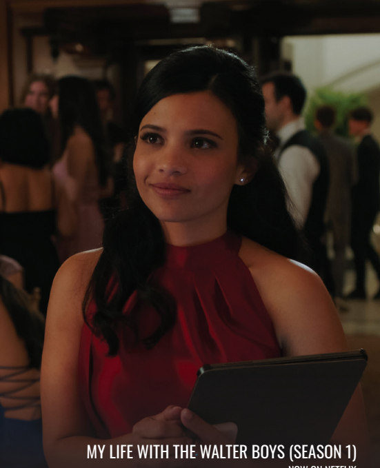
NOW ON NETFLIX © 2023 CPT HOLDINGS, INC. AND IGENERATION STUDIOS. ALL RIGHTS RESERVED.

Enrollment is for the entire year. You can change your election during the next open enrollment.